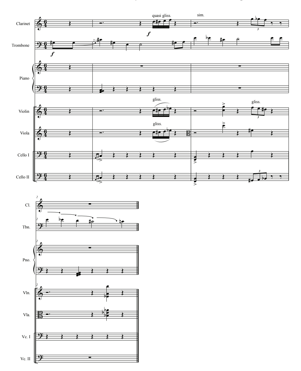
Example 4. Boris Tischenko, Severnie etudy . No. 9: Babka Yliana. Veselie igrushki