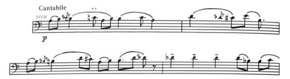
Example 2. – Sergey Slonimsky, Three pieces for violoncello solo . No. 2: Chromatic chant

Three pieces for violoncello solo, constructed on a simple melodic core, unfolds gradually, starting from a small motive. This cochlear structure unwinds with deepening tone structure. The composer methodically returns to the same intonation within a whole tone, using the interval as thoroughly as possible.